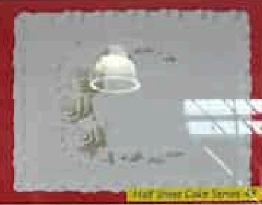
Half Sheet Cake Serves 48