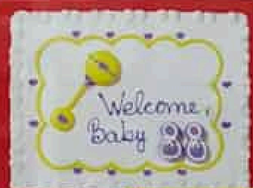
Half Sheet Cake Serves 48