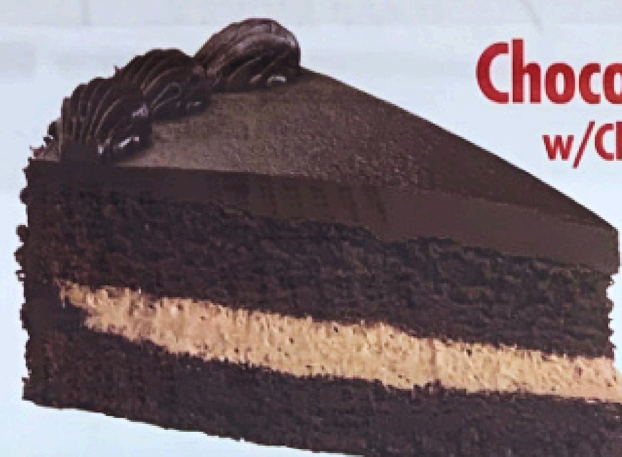
Chocolate Cake w/Chocolate Mousse Filling