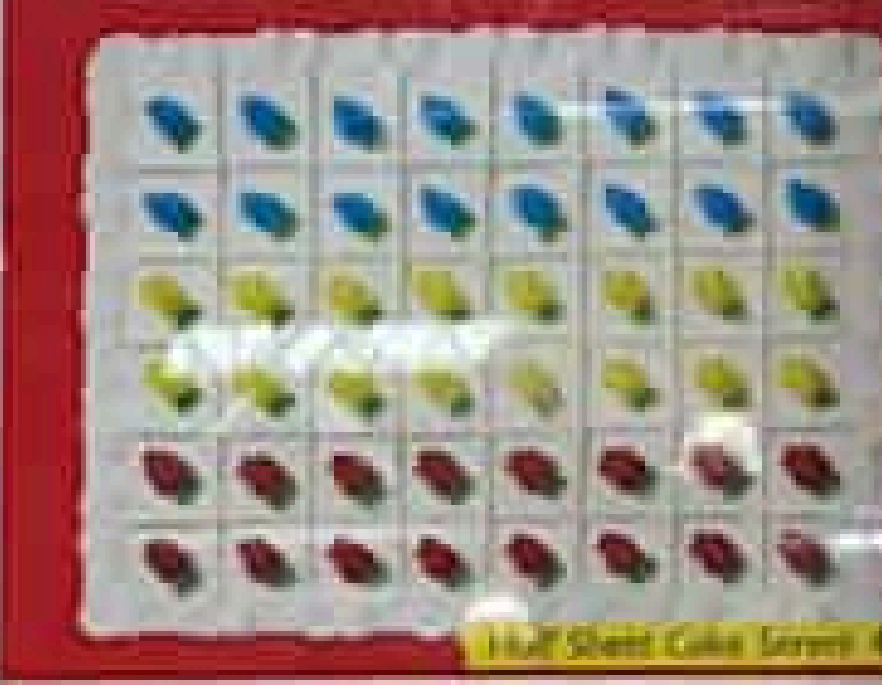
Half Sheet Cake Serves 48