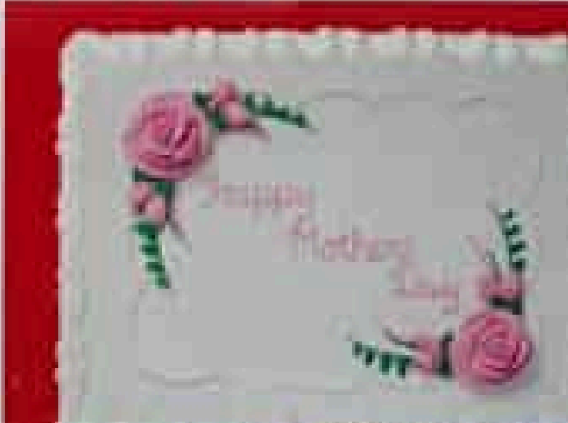
Half Sheet Cake Serves 48

One Day Advance Notice Appreciated On All Special Order Cakes