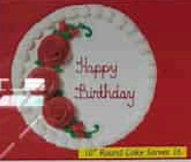
10" Round Cake Serves 16