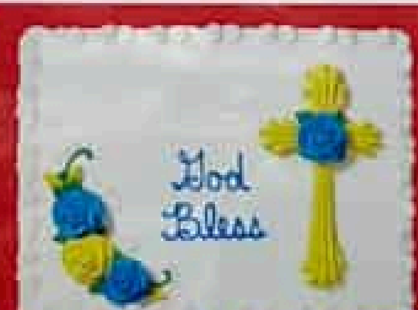
Half Sheet Cake Serves 48