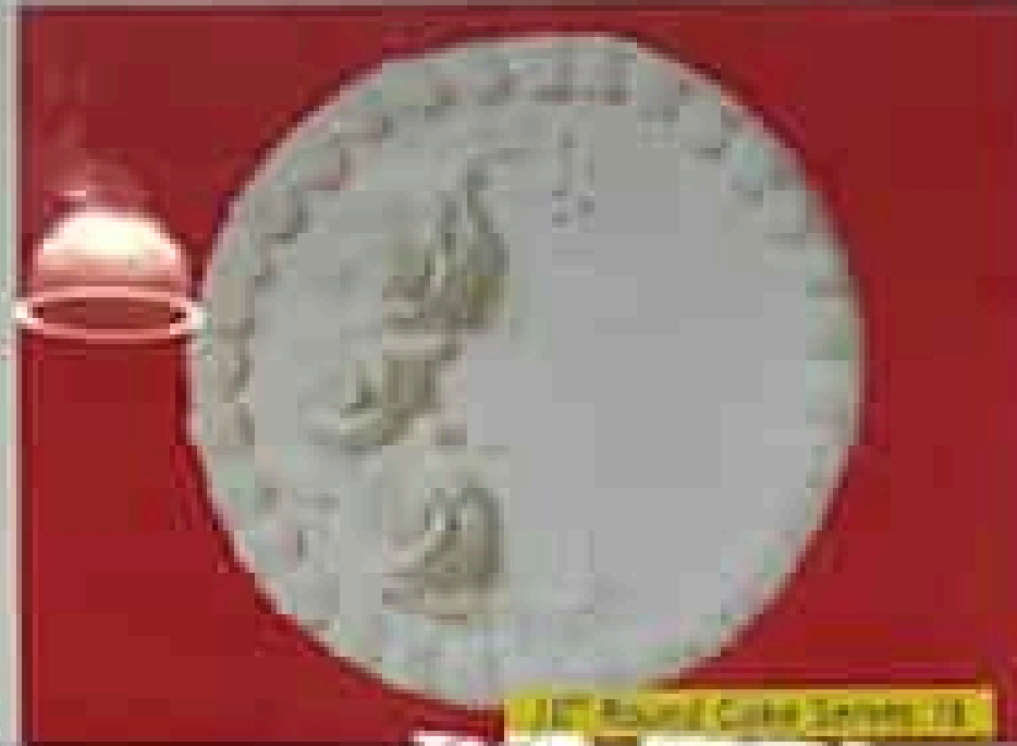
10" Round Cake Serves 16