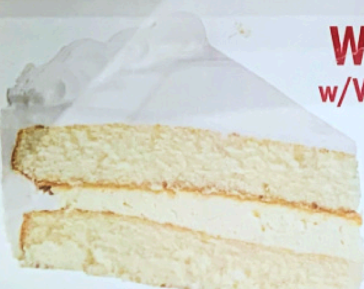
White Cake w/Vanilla Cheesecake Mousse Filling