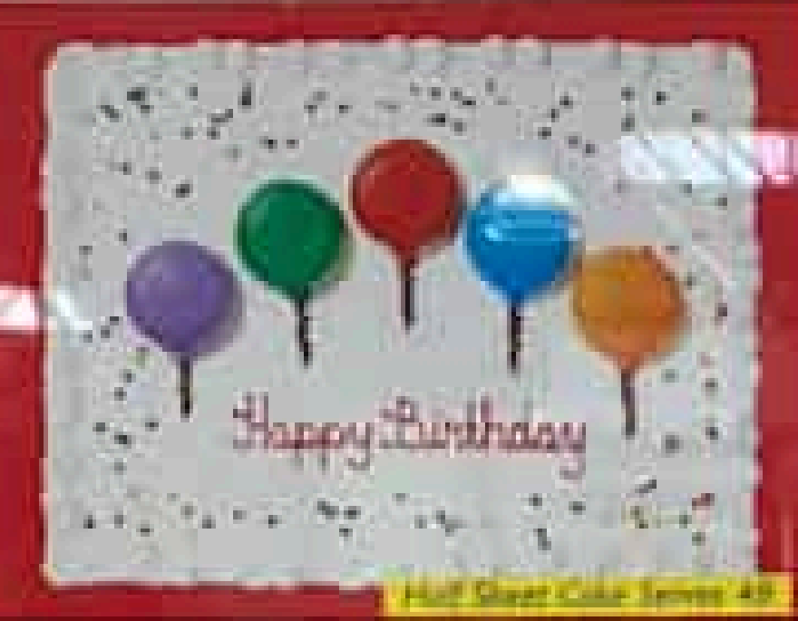
Half Sheet Cake Serves 48