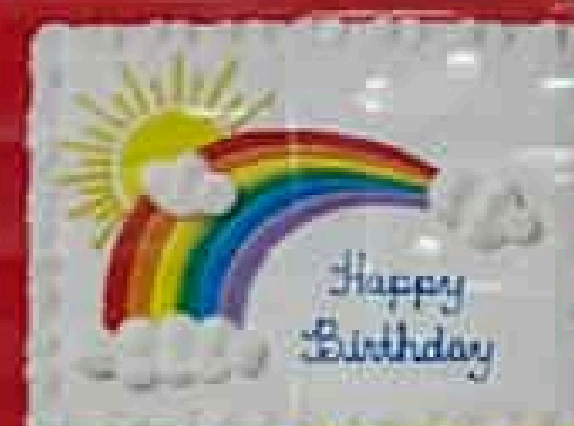
Half Sheet Cake Serves 48