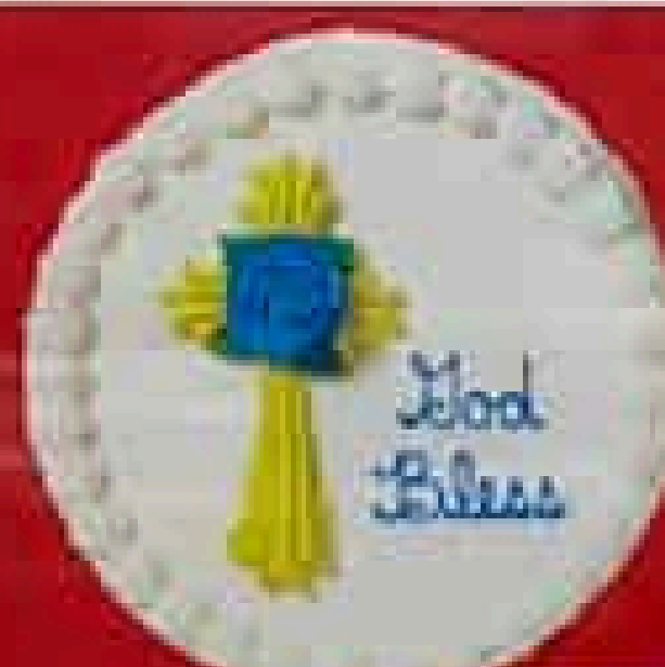
10" Round Cake Serves 16