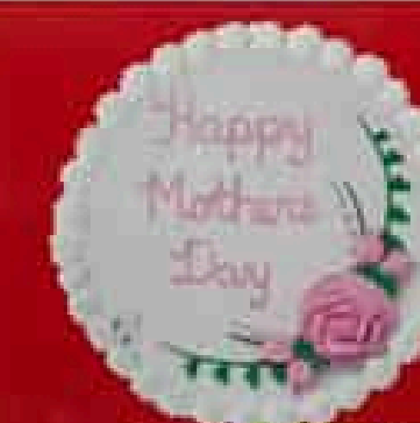
10" Round Cake Serves 16