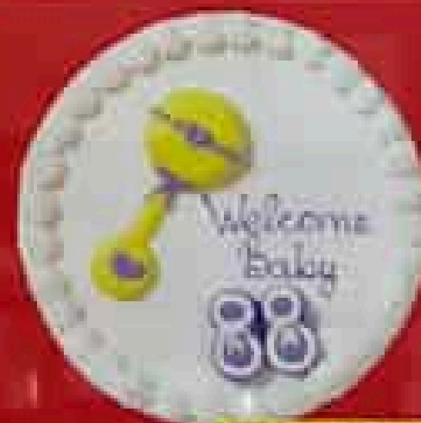
10" Round Cake Serves 16