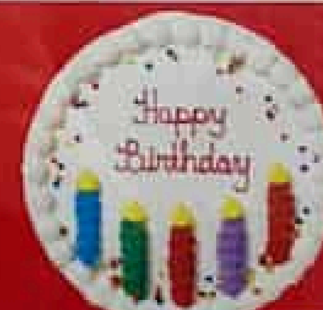
10" Round Cake Serves 16