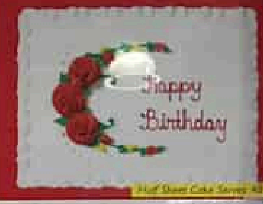
Half Sheet Cake Serves 48