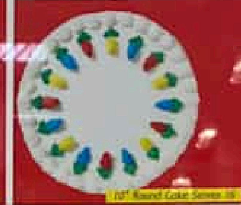
10" Round Cake Serves 16