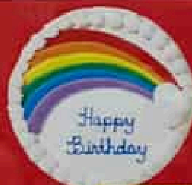
10" Round Cake Serves 16