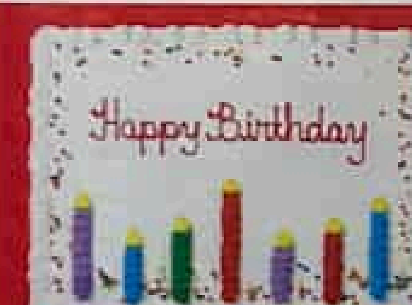
Half Sheet Cake Serves 48